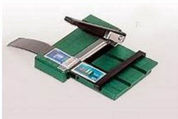
Prinz Guillotine cutter